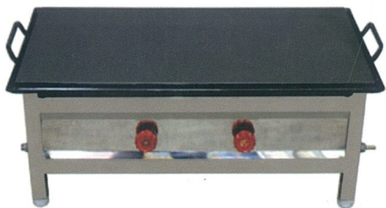
Table Top Dosa Plate